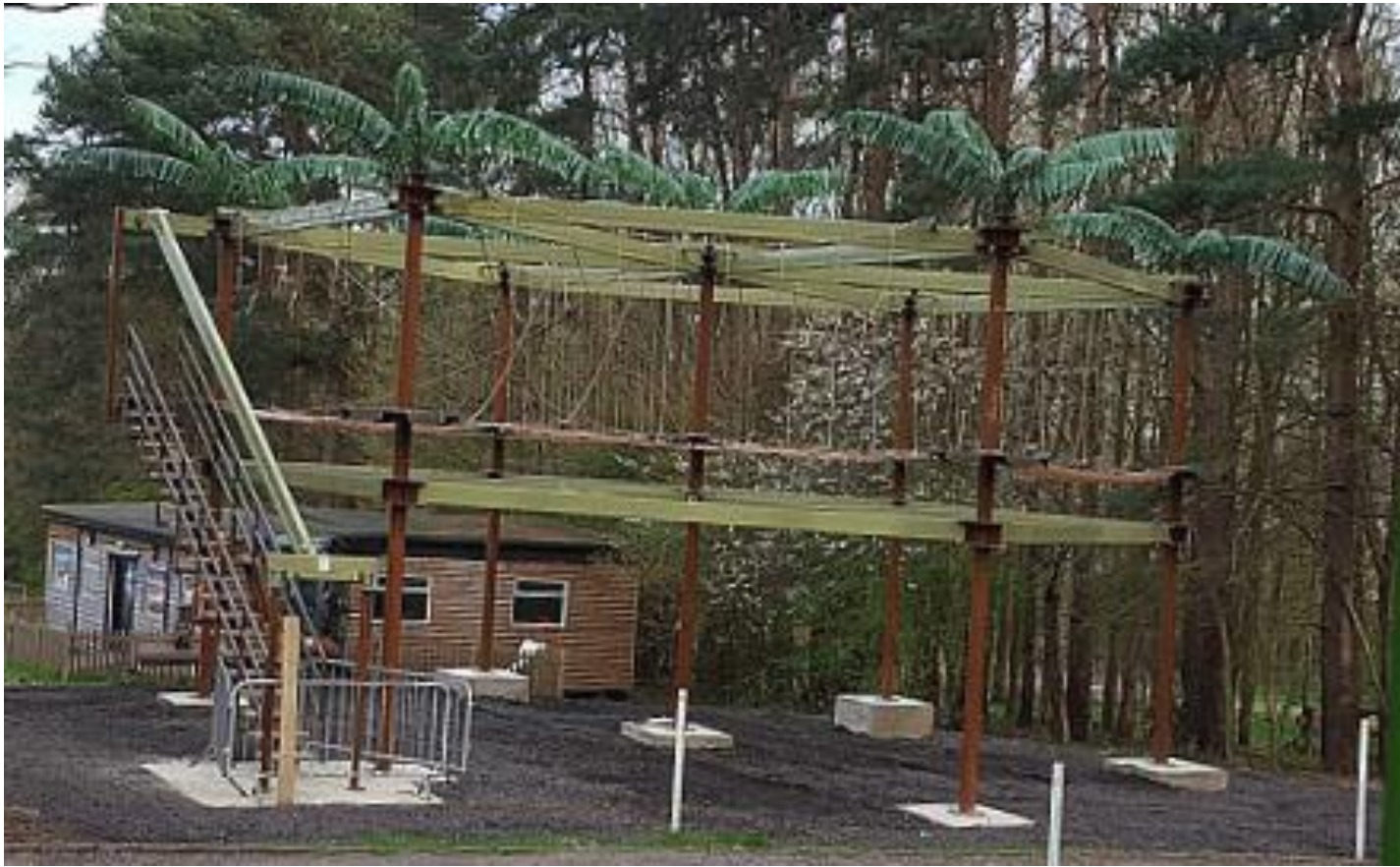
Tree top climbing