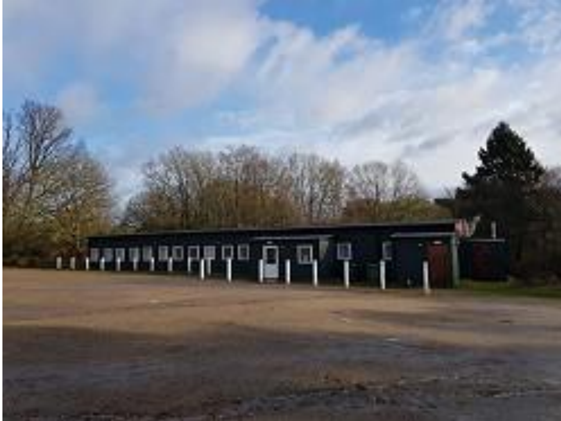
Tolmers Activity Centre, Cuffley